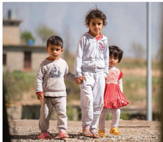
Three children walk near a clinic sponsored by St. Elizabeth University's Project for Iraq in Need (STEP-IN). The clinic receives support from the Knights of Columbus Christian Refugee Relief Fund.

Share your Lenten practices across the world via social media — simply use the hashtags #KofC and #Lent.