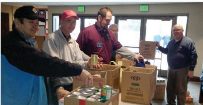
Members of St. Mark's Council 12172 in Boise, Idaho, sort through some of the record 11,850 pounds of food collected during the 40 Cans for Lent campaign. The boxes were labeled by type of food to expedite organization of the donations.

For more reports on different programs and initiatives from our brother Knights, visit kofc.org/knightsinaction . To share your story, visit kofc.org/en/knights-in-action/kia_news.html .