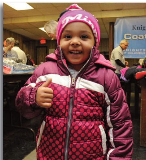
Happy anniversary to our Knights! This year marked the fifth anniversary of our Black Friday Coats for Kids distributions. For details, visit kofc.org/coats .